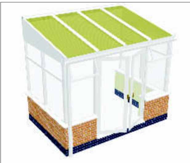
Figure 5 Combination style conservatory roof