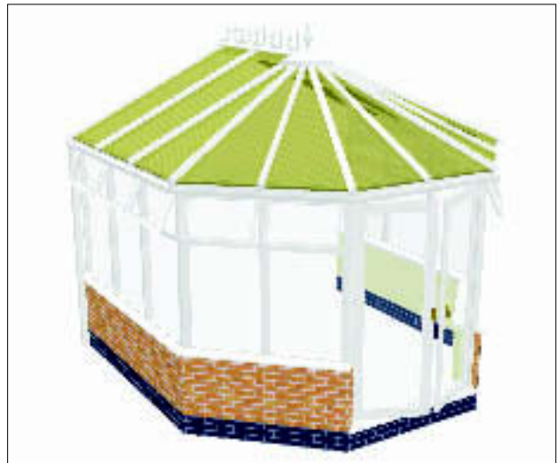
Figure 2 Edwardian style conservatory roof