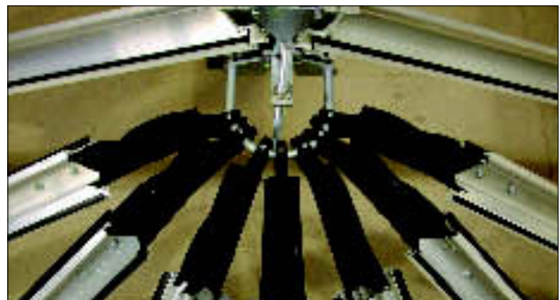
Figure 7 Spider bar assembly

1.7 Glazing panels or units supported by the glazing bars are located into the ridge system through a PVC-U glazing trim with a TPE co-extruded gasket, which provides a seal against the